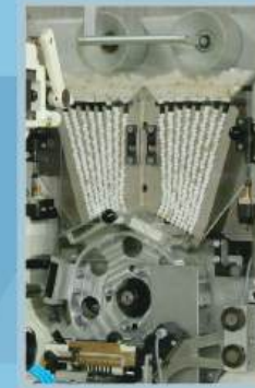
Double Plunger Hopper (Speed up to 180ppm)