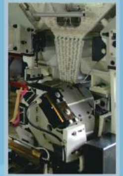
Single Plunger Hopper (Speed up to 150ppm)